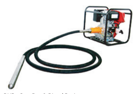
DUF » Gasoline & Diesel Engine